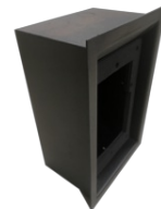
TA-18 Item number: 1008140180