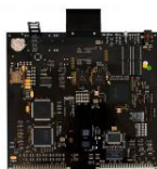
CARTE PROCESSEUR AMC-IP VERSION 11